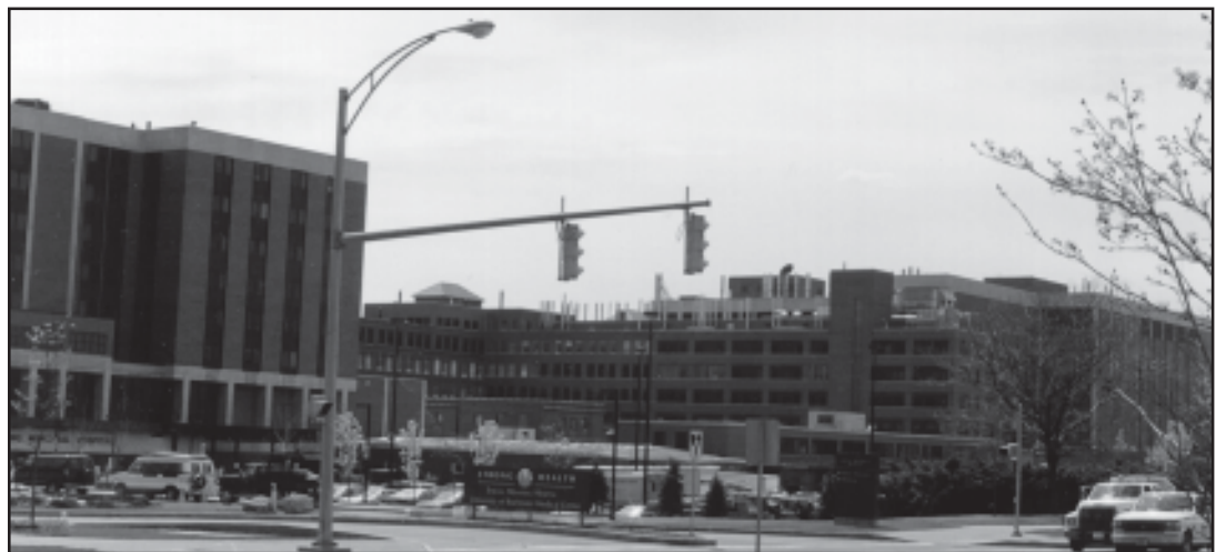
University of Rochester Medical Research Laboratory Renovation

The completion schedule was critical - the project had to be designed, space demolished and new laboratories built in just eight months. Complicating the work was the fact that the space to be renovated was in the lower levels of an existing, seven floor facility. This space had to be completely gutted and the mechanical and electrical